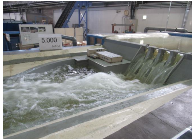
Flow test at a rate of 5,000 m 3 a second

Funagira Dam is a concrete gravity dam on the Tenryu River in Hamamatsu, Shizuoka. It was found that the river bed in the downstream area was being eroded even though a huge number of wave-dissipating concrete blocks, so-called tetrapods, had been placed there. Using the 1/50 model, they investigated the effect of the placement of the blocks. (See the photo below). Yellow, blue, white and gray blocks have different sizes. The investigation indicated that