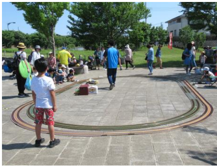
Satoyama Park: O-gauge train