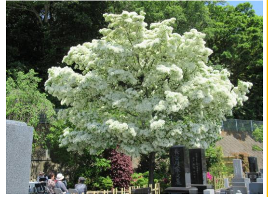
Jyojuin Temple: Fringe tree