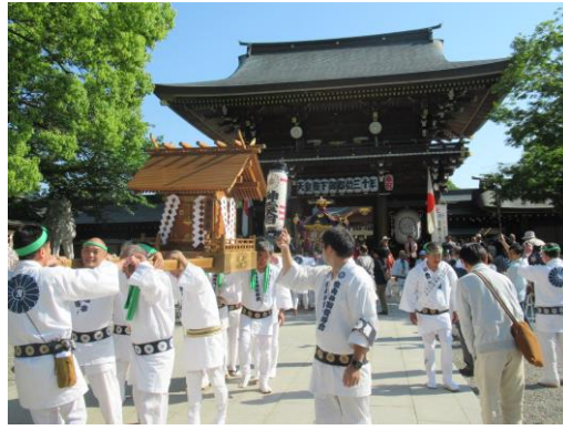
Samukawa Shrine: Kokufu festival

Bottom: Satoyama Park was crowded with a lot of families. Chigasaki Beach was still quiet.