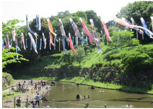
Satoyama Park: Carp streamers