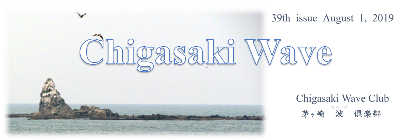
Sea breezes are like precious friends, easing your mind, and whispering encouragement to you.