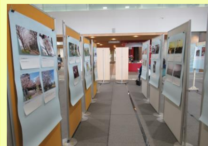
Photo Exhibition by Chigasaki Kyodo Kai

From Oct. 3 (Thurs) to 6 (Sun), the exhibition room on the 1st floor was filled with various pieces of artistic handicraft such as hand-knitted clothes, ceramic works, tie-dyed clothes, paper crafts, leather goods, artificial flowers, paintings, kites and so on. The visitors stopped, looked at exhibits and enjoyed talking about their favorite works. Some works were very complex, and made visitors admire the creators' perseverance. As some paintings looked almost like photos, visitors scrutinized them to learn how painters drew them.