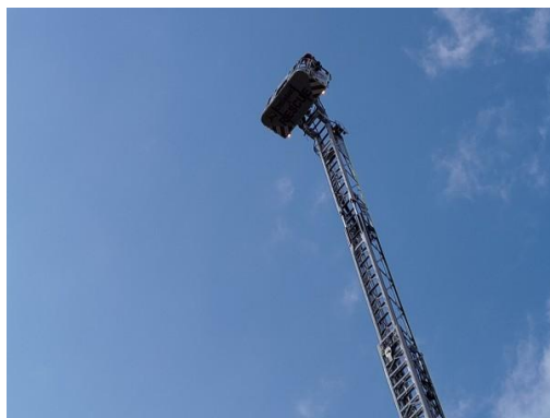
Ladder truck boarding

Chigasaki Firefighting Disaster Prevention Festival 2025 took place on Nov. 16th (Sun) at Chuo Koen. A ladder truck, an earthquake-simulation vehicle, a fire pump, and construction machines, including a bulldozer and a loading shovel, were on display there.