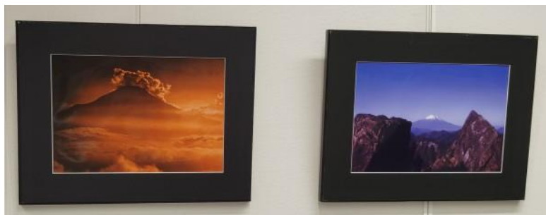
Mt. Fuji from Tanzawa

Sixty-four photos, two by 32 members each, were on display.