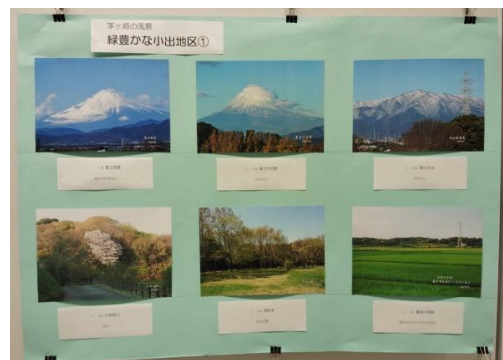
Scenes in the Koide area

Sixty-four photos, two by 32 members each, were on display.